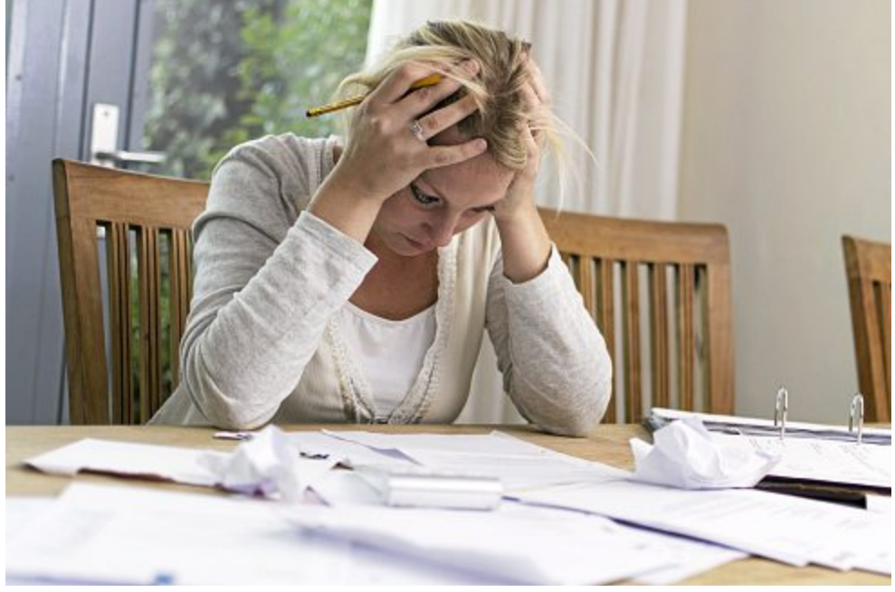
CUTS WILL CREATE CRISIS: Community Legal Centres are often the only source of legal support for regional and rural residents to go for advice.

"Until then our communities don't have any