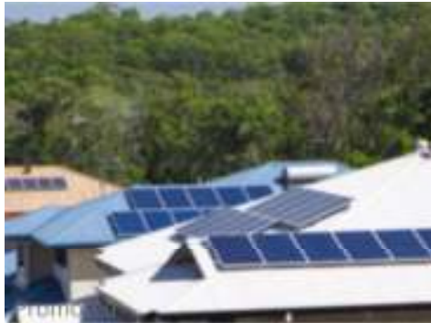
Government Rebates Make Solar Cheaper To Buy

( https://www.esuperfund.com.au/why-us/casestudy/catriona?utm_source=plista&utm_campaign=content&utm_medium=cpc&utm_content=2A )