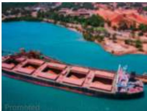
The mining boom isn't over.

( http://dailymercury.com.au/news/raped-choked-beaten-backpackers-road-trip-horror/3151556/ )