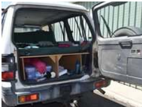
Backpacker horror: How this service station saved her life

( https://www.solarquotes.com.au/solarrebate.html?utm_source=plista&utm_medium=cpc&utm_campaign=rebateplh3 )