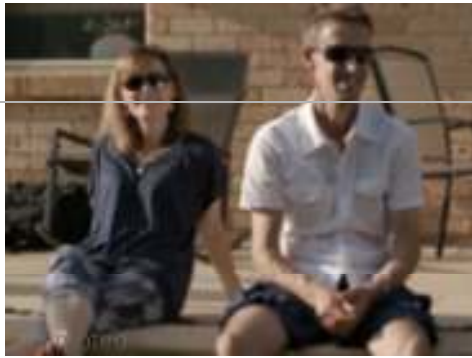
[Video] Getting SMSF investment right

( https://www.esuperfund.com.au/why-us/casestudy/catriona?utm_source=plista&utm_campaign=content&utm_medium=cpc&utm_content=2A )