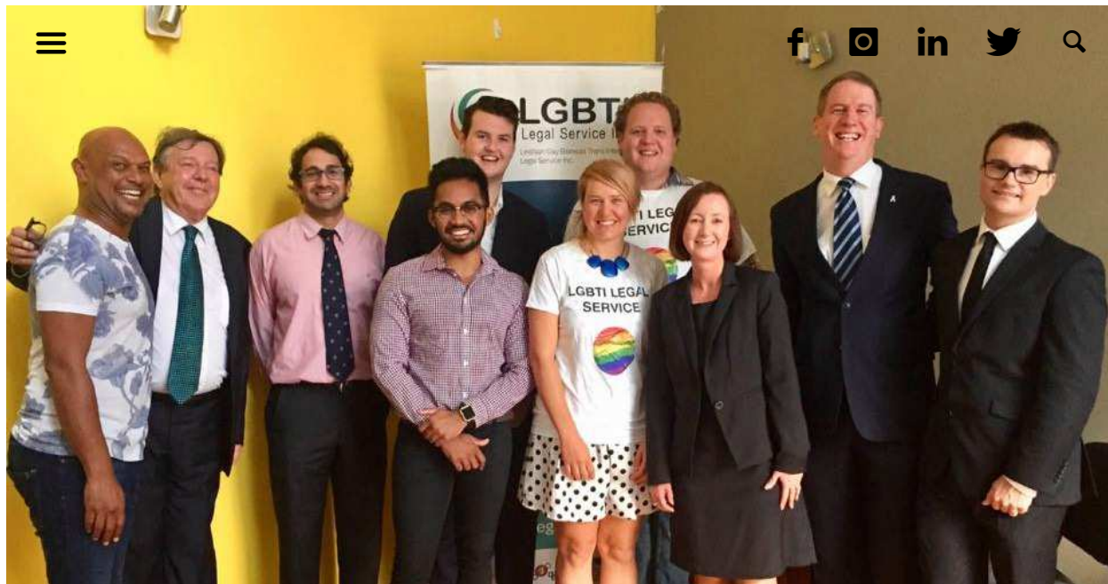
📷 LGBTI Legal Service.

LGBTI Queenslanders have welcomed an announcement that the volunteer-run LGBTI Legal Service will receive funding from the Queensland Government, meaning more people will be able to get legal help.