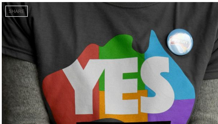
The Like Love project will run during the same-sex marriage postal vote over the next two months.

The LGBTI Legal Service will run a project named Like Love, involving training and co-ordinating volunteers to monitor online forums, media and posters to ensure accountability where unlawful vilification may have occurred.