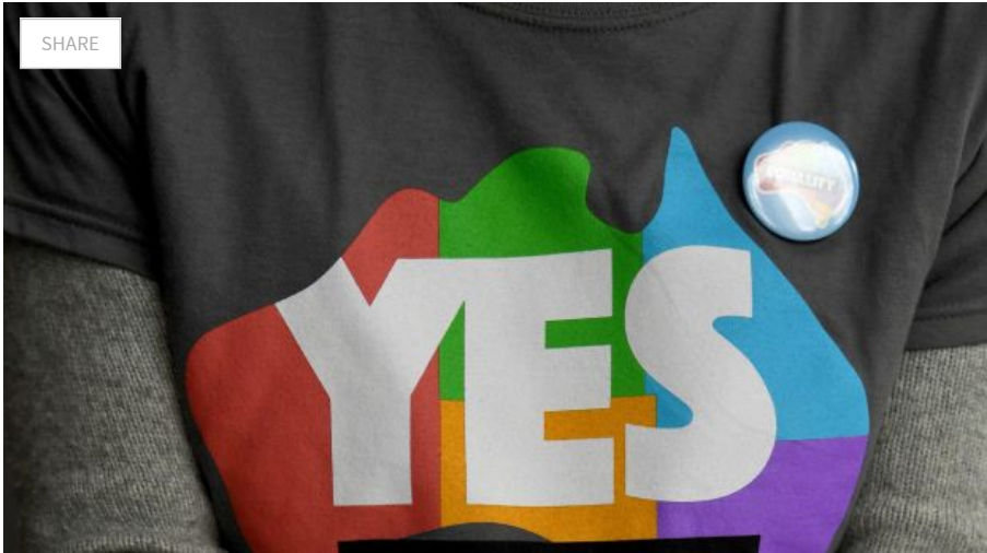
The Like Love project will run during the same-sex marriage postal vote over the next two months.