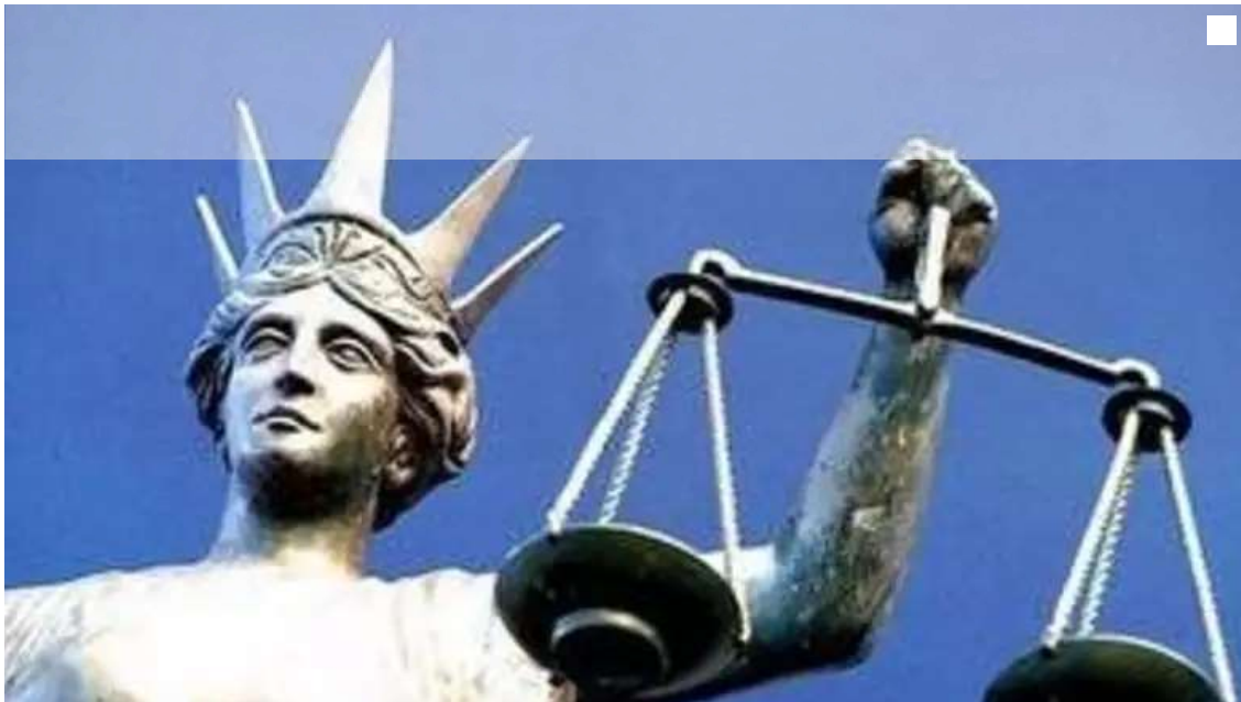
The Palaszczuk government will introduce a human rights act for Queensland.

Australia does not have a national Bill of Rights like the US, but the Palaszczuk government has confirmed it will keep its commitment to introduce a human rights act.